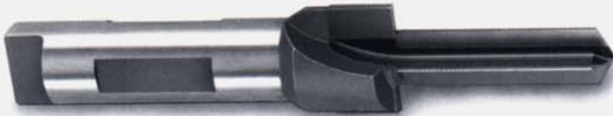
Solid carbide head burnishing drill with carbide tipped spot facer