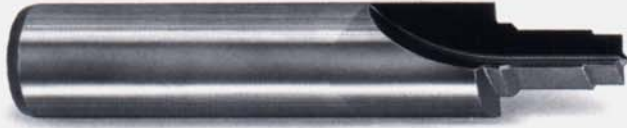
V-Braze Solid carbide head multi-diameter combination spot facing drill